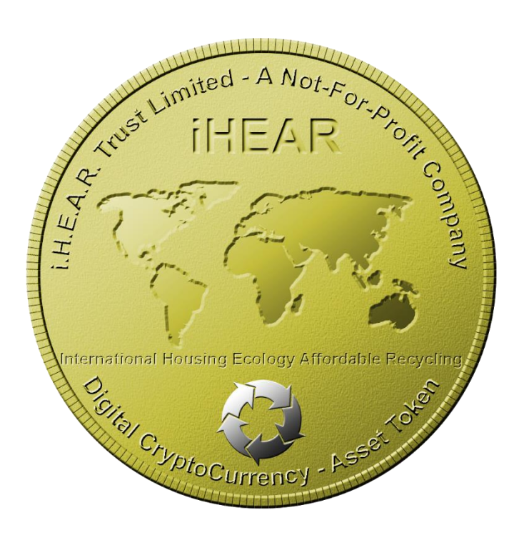
Our CryptoCurrency Token

This is where i.H.E.A.R. Trust will raise funding: to deepen our research, reach formal relationships with partners, build our team, become an incubator for new technologies and projects that will help our planet, improve living standards internationally, by supporting new projects, developing open-source techniques, and supplying resources.